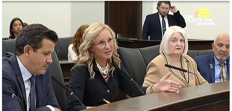
Watch Senate Democrats Conversation with Health Care Providers on Abortion here .

This is effectively an all-out abortion ban - with exceptions that are a slap to the face to victims of rape and incest. It gives crisis pregnancy centers more taxpayer money - $25 million! - instead of reviewing these fake clinics and their shady actions in an unregulated environment.