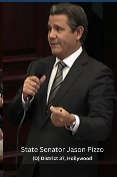
State Senator Jason Pizzo (D) District 37, Hollywood